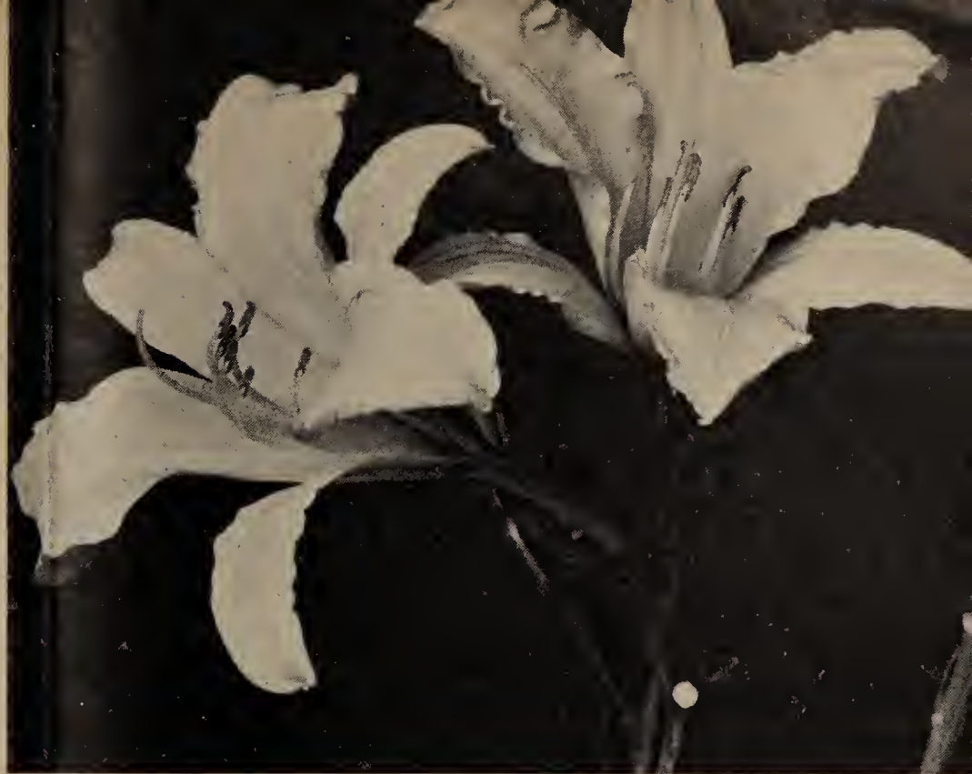
Hemerocallis or Day Lilies

HORNED POPPY , in a large rock garden, gives a fine touch of color and stands much heat and drouth. See page 31.